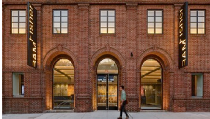
Outside View of the BAM Fisher

The BAM Fisher will be open at 10:30 on the day of the relaxed performance. In the lobby is the Box Office where you can pick up your ticket from a member of Treehouse Shakers. Audience members will also be able to purchase merchandise from this time onwards.